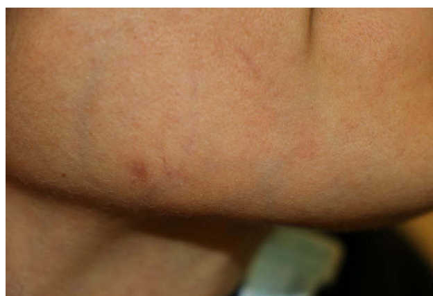
Figure 3 Fully resolved follicular hyperkeratotic spicules after treatment with 1% ivermectin cream for three weeks.

The patient was initially prescribed a topical application of 5% Permethrin cream twice daily; however, a three-week follow-up examination revealed only 70% improvement with evident follicular spicules (Figure 2). As a result, the treatment approach was modified to 1% Ivermectin cream (Soolantra) twice daily. The next three-week follow-up revealed that the follicular spicules had cleared entirely (Figure 3).