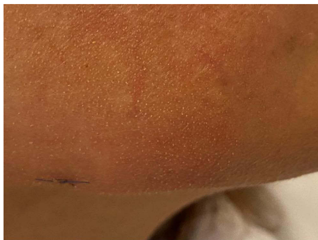
Figure 1 Facial follicular hyperkeratotic spicules on right anterior jaw line.

The patient reported with dry skin with numerous follicular hyperkeratotic spicules with a rough consistency in the anterior aspect of the right jaw and across the mid-zone that could be palpated on physical examination (Figure 1). During the two years of prior treatment, no skin biopsy had been performed, and the treatment plan had followed that typically prescribed for rosacea, ie, topical drugs. However, this had only slightly improved the patient's condition. Therefore, we performed a skin punch biopsy and sent the tissue for pathological analysis. A histological inspection of the tissue specimen revealed that the epidermis contained noticeable hair follicle dilatation and numerous Demodex mites extruding from the surface surrounded by a ring of dense homogeneous eosinophilic hyperkeratotic material.