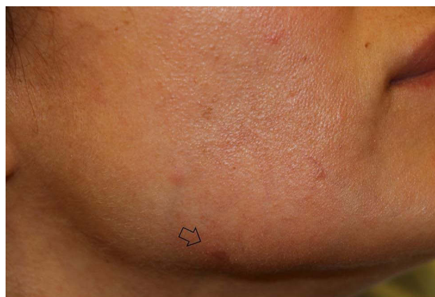
Figure 2 Facial follicular hyperkeratotic spicules after three weeks of treatment with 5% permethrin.