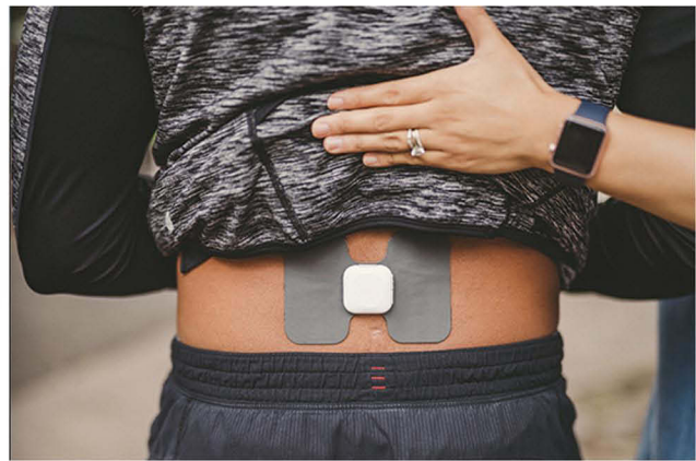
Figure 1 HFIT Device.

Notes: HFIT device (left), HFIT device worn on model (right).