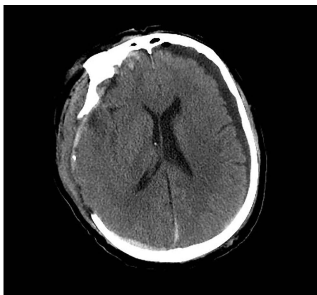
Figure 1 CT findings of subdural effusion after DC in the pressure dressings group.

In addition, we also analyzed the length of hospital stay (<30 days or \geq 30 days) and the total hospitalization