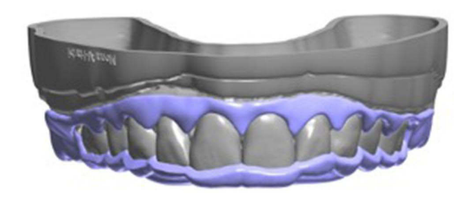
Figure 3 Designing the esthetic crown lengthening stent digitally.