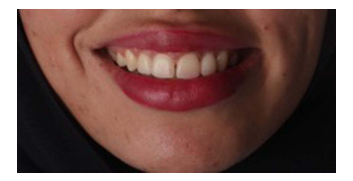
Figure 10 After 12 months follow up.

digital guide and find that it is reliable, accurate and reduces surgical time. This digital workflow controls the lab work instead of the old-style method of manual guide construction. This digital modern technique can easily manage the complicated periodontal case more accurately and quicker. Using a diagnostic wax-up procedure for