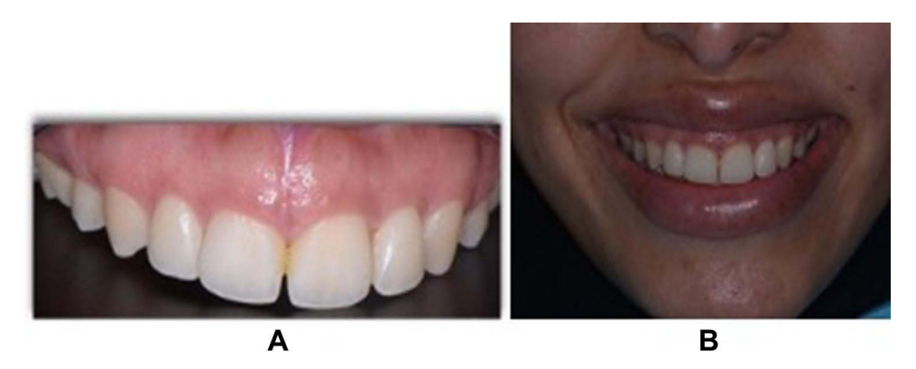
Figure I (A) Intraoral photography showing excessive gingival display, and (B) extraoral.

technology has become reliable and affordable with many applications for surgical and restorative workflows.<sup>4</sup>