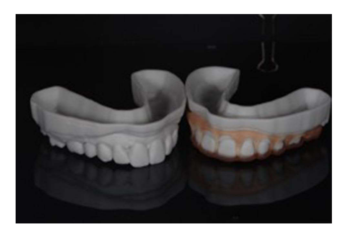
Figure 4 3D printed cast and surgical guide.