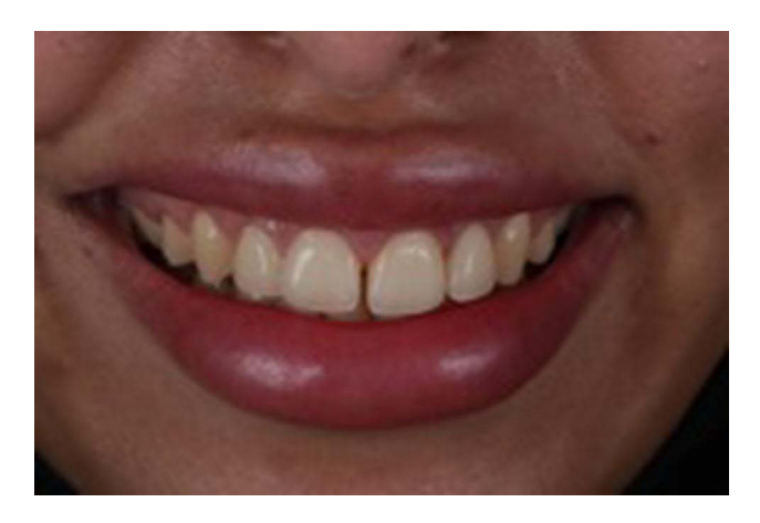
Figure 9 Showing postoperative healing after 6 weeks.