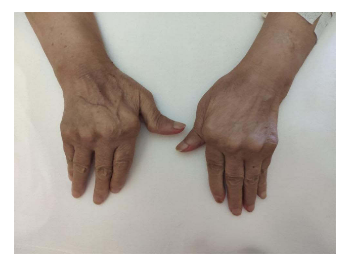
Figure 2 Joint deformities of the hands.