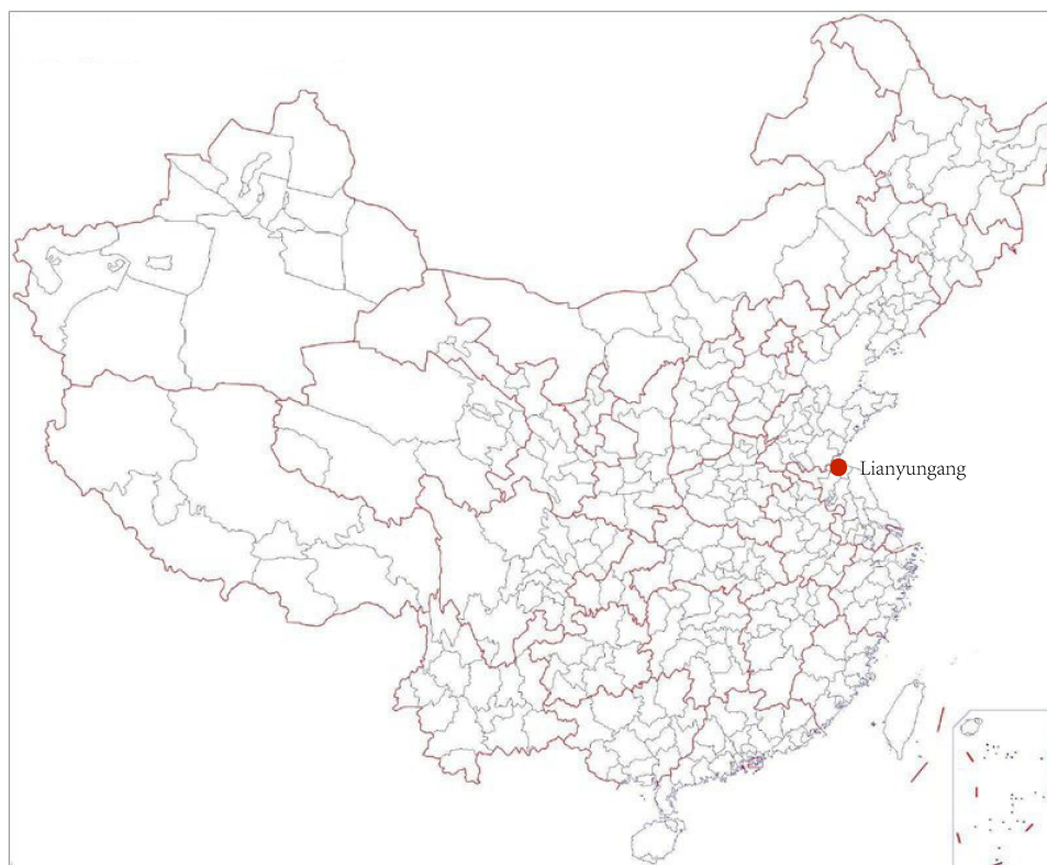
Figure 1 Geography of Lianyungang in China.

successfully complete an ultrasound of the hip, and if patient's guardian was willing to participate in this study and sign a written informed consent. Those with poorly completed medical records, lacking epidemiological data necessary for this work, and who had undergone some kind of prior therapeutic intervention for DDH elsewhere were excluded. The Ethics Committee of the First People's Hospital of Lianyungang approved all protocols (December 2021; approval no. 20210203).