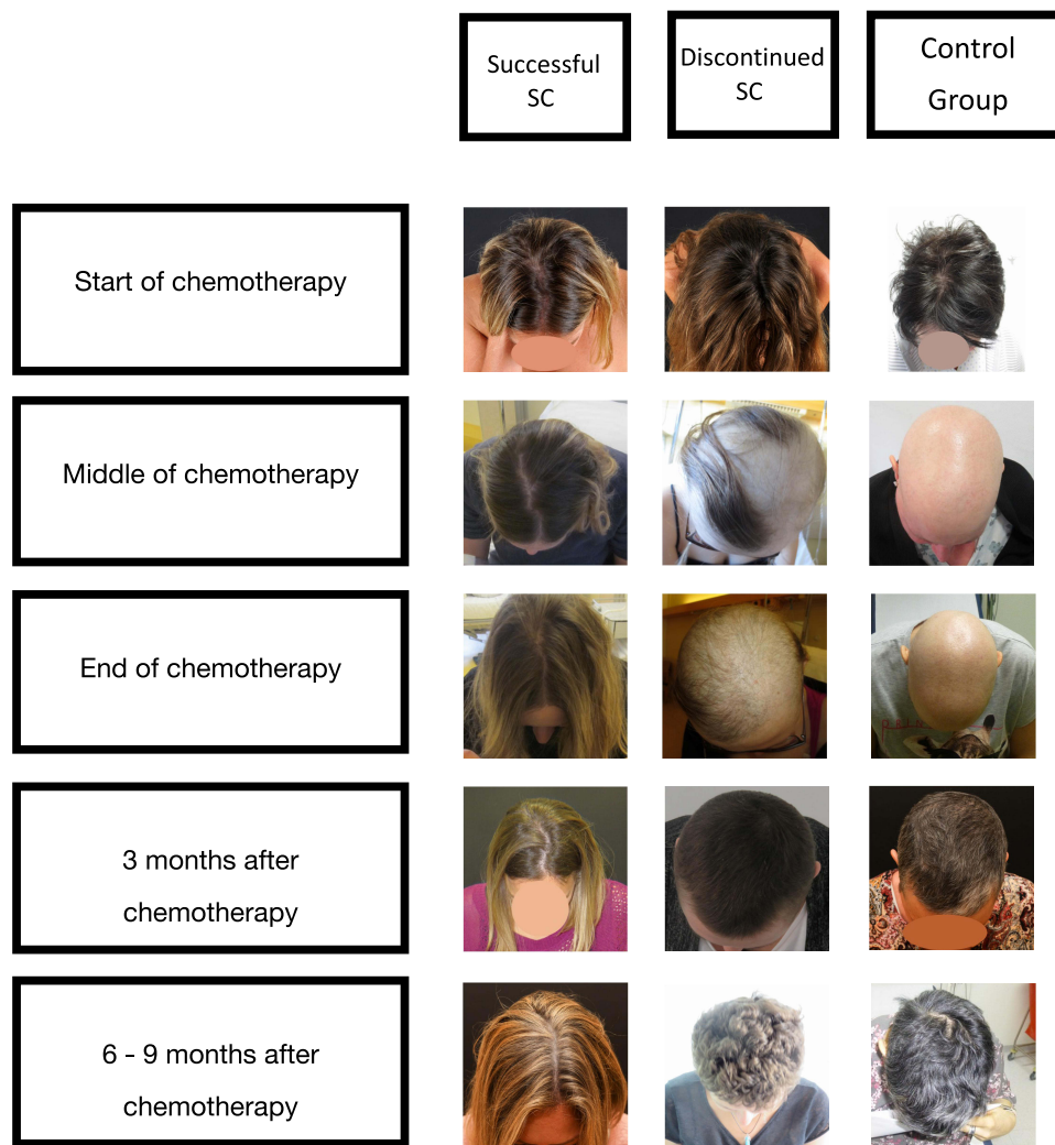
Figure 2 Patient examples of scalp cooling results over the course of CT treatment.

impacts on study outcome. It is well-known that the generalizability of clinical trial data into clinical routine, to “real-world” patients, underlies limitations. 22–24 Observational studies such as our Hair Safe study provide complementary data to the essential, “gold-standard” data derived from clinical trials. 24