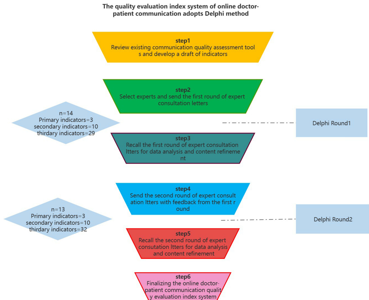
Figure 1 Flow chart for establishing indicator system.

The selection of experts for consultation was based on several key principles. Firstly, the experts needed to possess a deep familiarity with the subject matter and hold authority in the industry. They should also demonstrate a strong