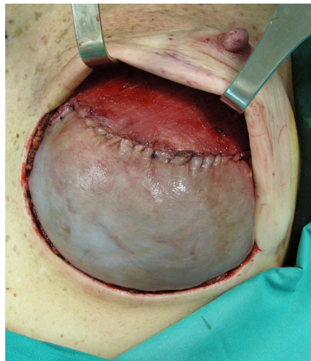
Figure 2 Intraoperative view of the left breast.

The good result obtained in this case may propose Veritas® as a viable alternative to Alloderm®, and may support its ability to sustain and stimulate recovery of the surrounding tissues even if it must be confirmed by more cases. The