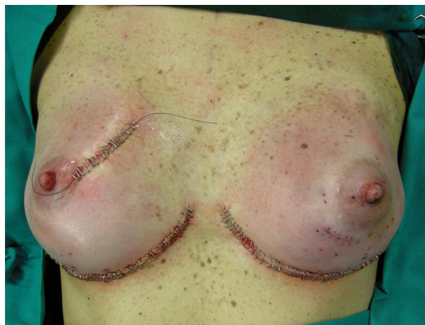
Figure 3 Immediate bilateral postoperative view.