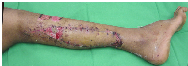
Figure 2 Outcome at 6 weeks showing successful coverage.

The peroneal artery flap has proved a worthy tool in the difficult problem of soft tissue coverage of the lower limb. As seen from our study population, it can be performed in adult patients as well as in small children. Most of our flaps were used for coverage of the middle and lower third of the leg as illustrated in Figure 2. Our experience has taught us that this is the most suitable site for the flap due to the close proximity of the septocutaneous perforators. The tibia was the most common structure exposed predictably due to the lack of soft tissue cover on the anterior aspect of the bone. As per surgical principles, aggressive debridement and negative cultures are essential prior to coverage with a fasciocutaneous flap, and this may explain the fact that we did not encounter any infection in our sample despite dealing with contaminated open fractures. The application of an external fixator in the same setting as rotating the flap did not adversely affect the outcome in anyway. However, the fixator should be applied first and then the flap performed. This avoids compromising vascularity of the flap by having to insert pins through it to achieve bony stability.