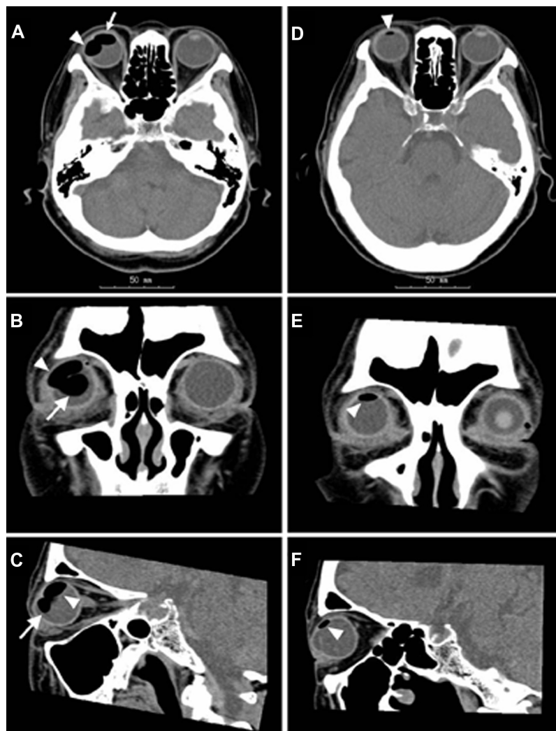
Figure 2 CT scans showing the presence of suprachoroidal gas. (A–C) On postoperative Day 7, two separate low-density areas of suprachoroidal gas (arrows) and intravitreal gas (arrowheads) are seen. (D–F) On postoperative Day 14, the intravitreal gas has resolved and a small amount of residual suprachoroidal gas is seen (arrowheads). Abbreviation: CT, computed tomography.