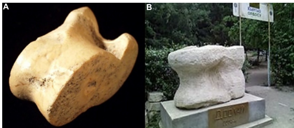
Figure 1 Primitive randomization devices.

We consider several objections raised by tradition against the clear and straightforward idea of using intentional allocation in the conduction of real-life clinical trials to achieve more balanced, and therefore comparable, groups.