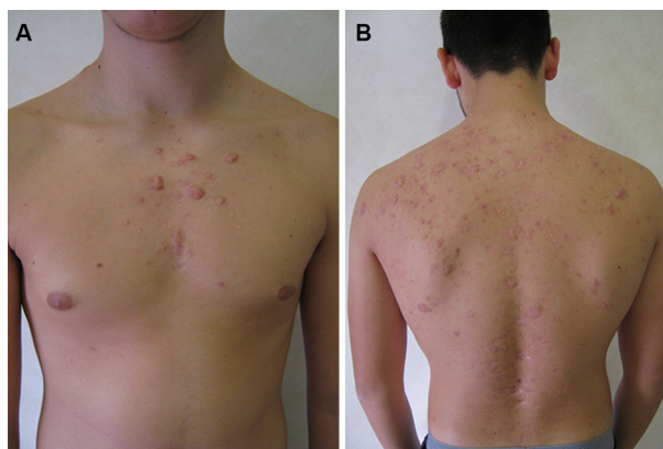
Figure 3 At follow-up visit 6 months after therapy cessation, no sign of relapse was observed. Some keloid scars developed on the chest (A) and shoulders (B).