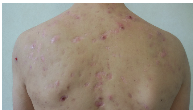
Figure 2 Regression of inflammatory nodules after 16-week isotretinoin treatment resulting in atrophic scars.

The patient and his parents gave their written informed consent for the publication of images and information.