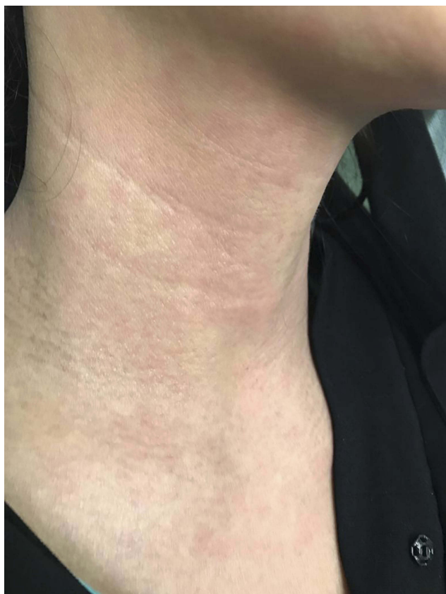
Figure 2 Multiple erythematous patches over the neck without scales.

Regarding the other infections, eg, herpes simplex, upper respiratory tract infection, and urinary tract infection, it was the same in both groups, which suggests that dupilumab does not affect the immunity against the invasion of microorganisms. 10