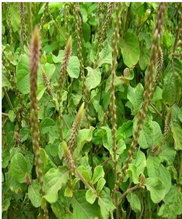
Figure 1 Achyranthes aspera from site of collection (Captured on 20/04/2019).

Achyranthes aspera L. (Figure 1), which belongs to the family Amaranthaceae , is found throughout tropical Asia, Africa, Australia and America and grows as a wasteland herb everywhere. It is used as folk medicine. Different researchers have investigated A. aspera both in-vitro and in-vivo for different biological activities; for instance, it is used in the indigenous system of medicine for its emenagogue, antiarthritic, antifertility, laxative, ecboic, abortifacient, antihelminthic, aphrodisiac, antiviral, antihypertensive, anticoagulant, diuretic, immunostimulant, antihyperlipidemic, antioxidant, and anti-tumor properties. 8 Additionally, the crude and solvent fractions of A. aspera were investigated for their antimicrobial activity using