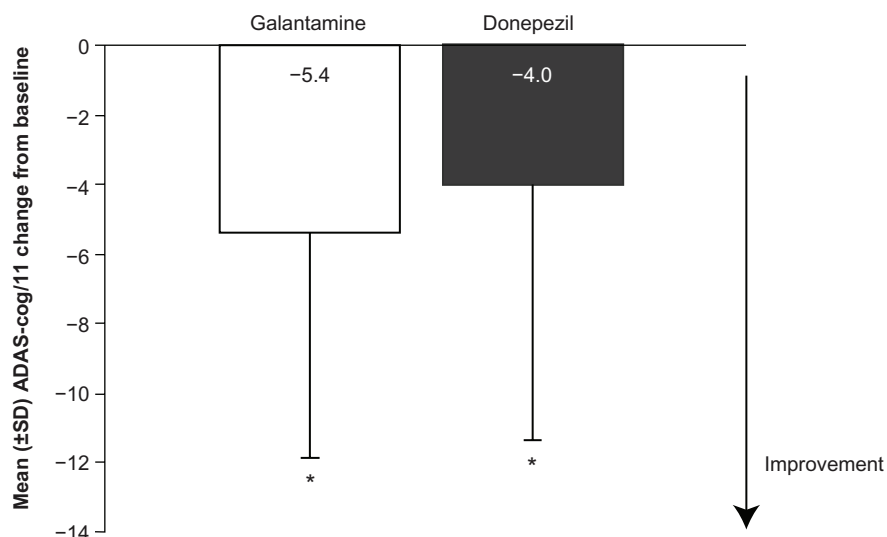
Figure 2 Mean change from baseline in Alzheimer's Disease Assessment Scale – cognitive subscale (ADAS-cog/11) score.