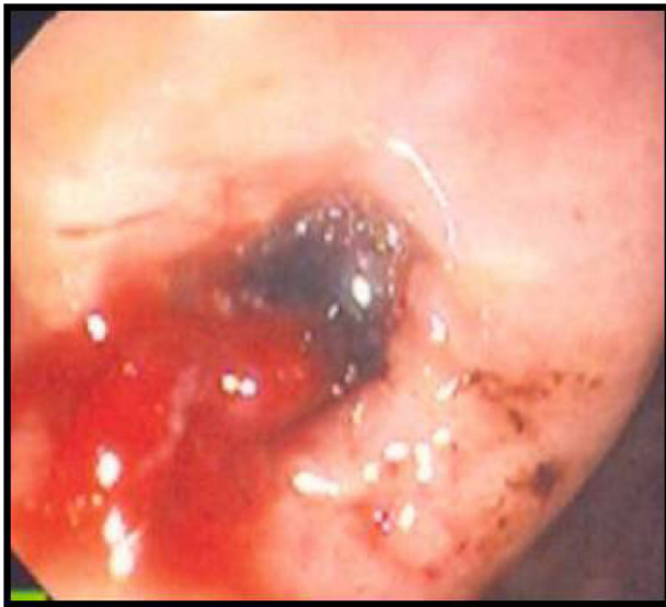
Figure 1 Endoscopic image of a 1×1 cm hemorrhagic gastric ulcer in the antrum with a visible vessel revealed by endoscopy.

Note: Endoscopy is from a 53-year-old woman presenting to the emergency department following two bouts of hematemesis and a melanic stool.