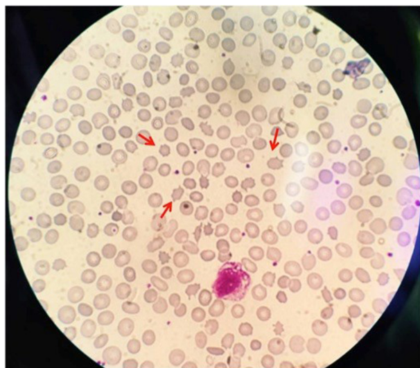
Figure 2 Peripheral blood smear showing acanthocytes (red arrows).

Written informed consent was obtained from the patient to publish case details and pictures. Ethical clearance was also