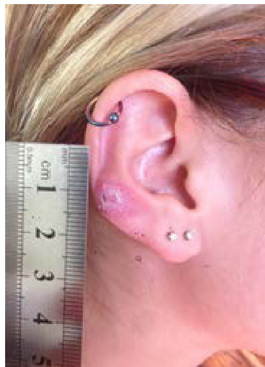
Figure 3 Keloid scar 5 months since the initial presentation with a flattened appearance.

A further 2 months on, the base of the keloid remained unchanged at 10 mm; however, the total thickness of the helix reduced to 7 mm. The posterior region of the helix remained a small flat patch, while the anterior of the helix presented with only minimal keloid content. At this time, another injection of 40 mg methylprednisolone acetate was administered. After completing a year's treatment with methylprednisolone