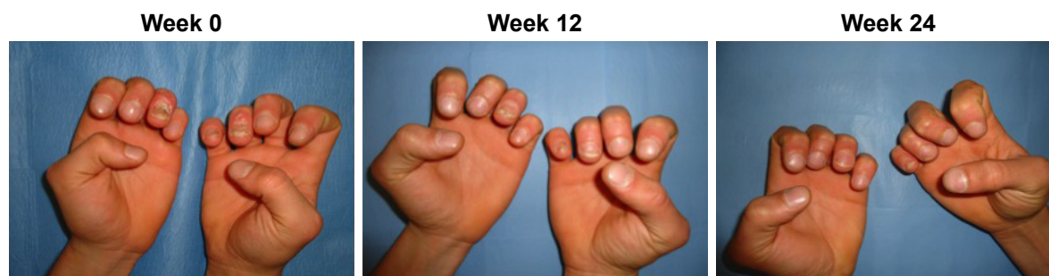
Figure 2 Patient affected by nail psoriasis at baseline (week 0). The same patient after 12 weeks and 24 weeks of treatment with apremilast.

apremilast was generally well tolerated during Phase III clinical trials, and in particular, most adverse events were mild or moderate in intensity and the incidence rate did not appear to increase over time. 44 The convenience of oral administration of apremilast is associated with its safety profile, and the tolerability of the side effect profile makes this medication an attractive choice for clinicians. 83,84 Apremilast should be considered in patients with joint and skin involvement. Apremilast is not only effective for moderate-to-severe psoriasis or PsA but it is also characterized by a good safety profile and does not require laboratory monitoring as with traditional biological agents.