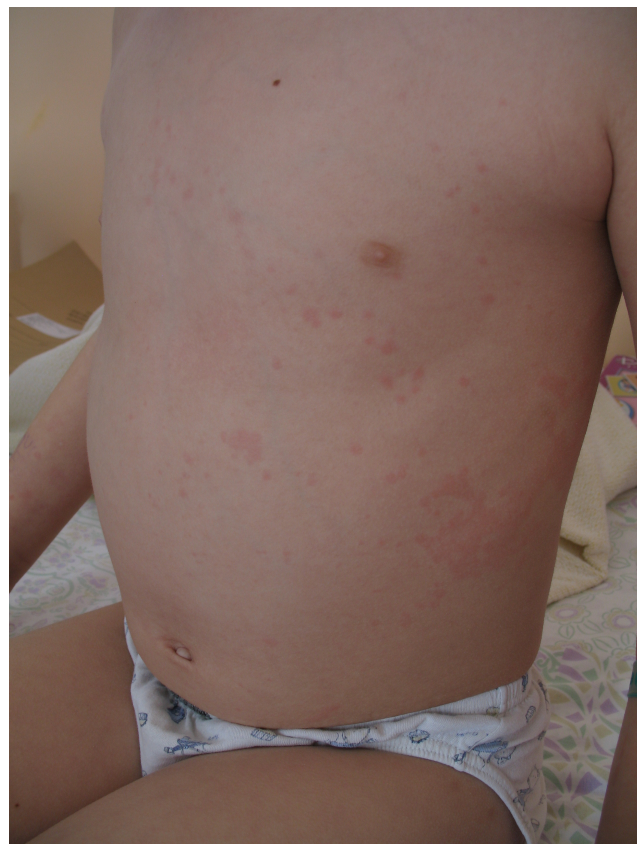
Figure 1 Evanescent (non-fixed) erythematous rash in an SJIA patient. Abbreviation: SJIA, systemic juvenile idiopathic arthritis.

Clinical presentation of SJIA differs from other JIA subtypes in several aspects: it includes typical quotidian fever, arthritis, and “salmon pink” rash that appears with the fever and fades away when the fever subsides (Figure 1). Lymphadenopathy, hepatosplenomegaly, and serositis, such as pericardial effusion, are also hallmarks of the disease and are not seen in other forms of JIA. 7 SJIA patients are more prone to develop MAS. Some SJIA patients have a monophasic course of the disease with only one episode of fever, others have a polycyclic course, and in some patients the disease persists after the initial attack of fever and follows the severe polyarticular course. 28 Systemic signs of the disease can sometimes be more amenable to treatment than chronic arthritis, which can be unresponsive to various treatment approaches. 29 Early predictors of joint damage and poor outcome are young age at diagnosis (<18 months of age), longer disease duration, persistent systemic use of