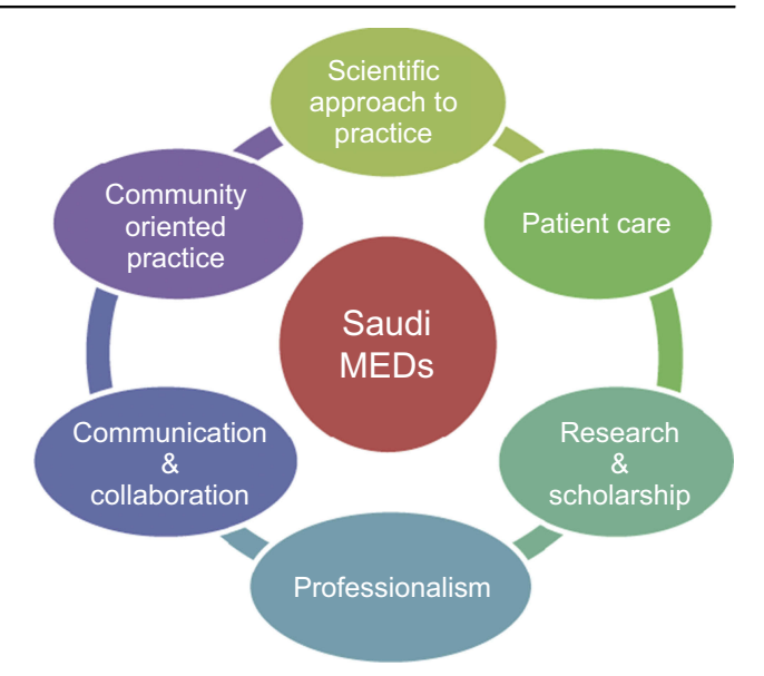
Figure I The Six Main Themes in SaudiMEDS. SaudiMEDs framework 2016: Saudi medical education directives framework. In press.