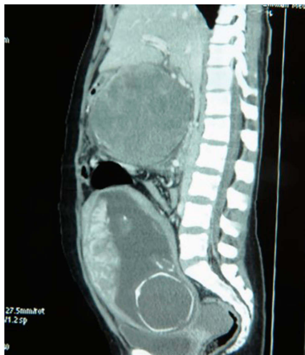
Figure 2 CT sagittal image shows heterogeneously enhancing pancreatic mass along with a fetus within the uterus.

Laboratory investigations revealed severe anemia (4.4 gm%), thrombocytopenia (33,000/cu. mm), deranged prothrombin time (PT – 60 seconds) and international normalized ratio (INR – 5), and hypokalemia (2.4 mEq/L). Amylase and lipase were within normal limits. The standard values of these lab parameters used in our hospital are presented at the end of the text. Ultrasonography (USG) showed intrauterine fetal death (IUID) of 26–27 weeks of gestation, a complex mass at the epigastric region (retro-peritoneal area), and gross hemoperitoneum. Computed Tomography (CT) scan of the abdomen (Figures 1 and 2) showed a well-defined, round to oval, heterogeneously enhancing mass measuring 18 cm x 12.5 cm, originating from the body of the pancreas, suggestive of pancreatic neoplasm. A significant amount of high-density collection in the peritoneal cavity was suggestive of hemoperitoneum.