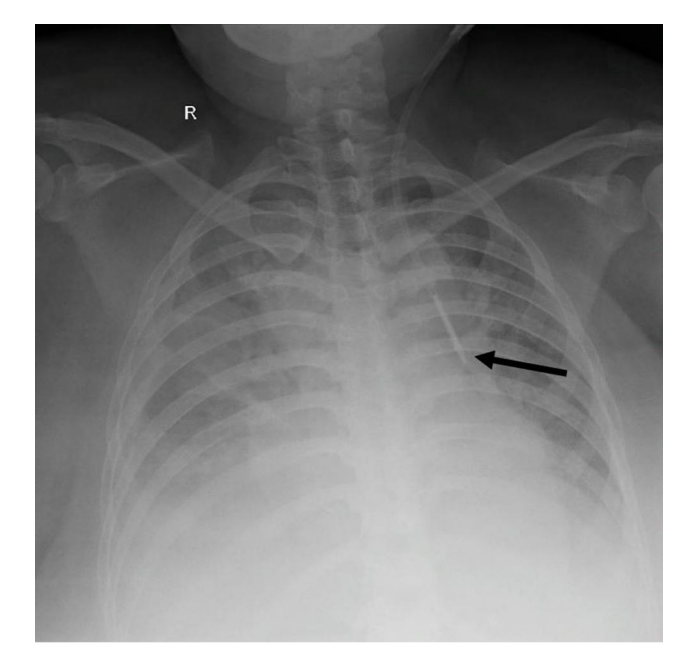
Figure I Anteroposterior chest x-ray shows the tip of the catheter inserted through the left jugular vein was located in the left mediastinum (black arrow).

The left internal jugular or subclavian catheter insertion should cross the midline to reach the right atrium. The inadvertent cannulation of the carotid artery was ruled out by blood gas analysis. An echocardiography was performed in the following day to confirm whether there was PLSVC. The result showed that there was definitely PLSVC (Figure 2).