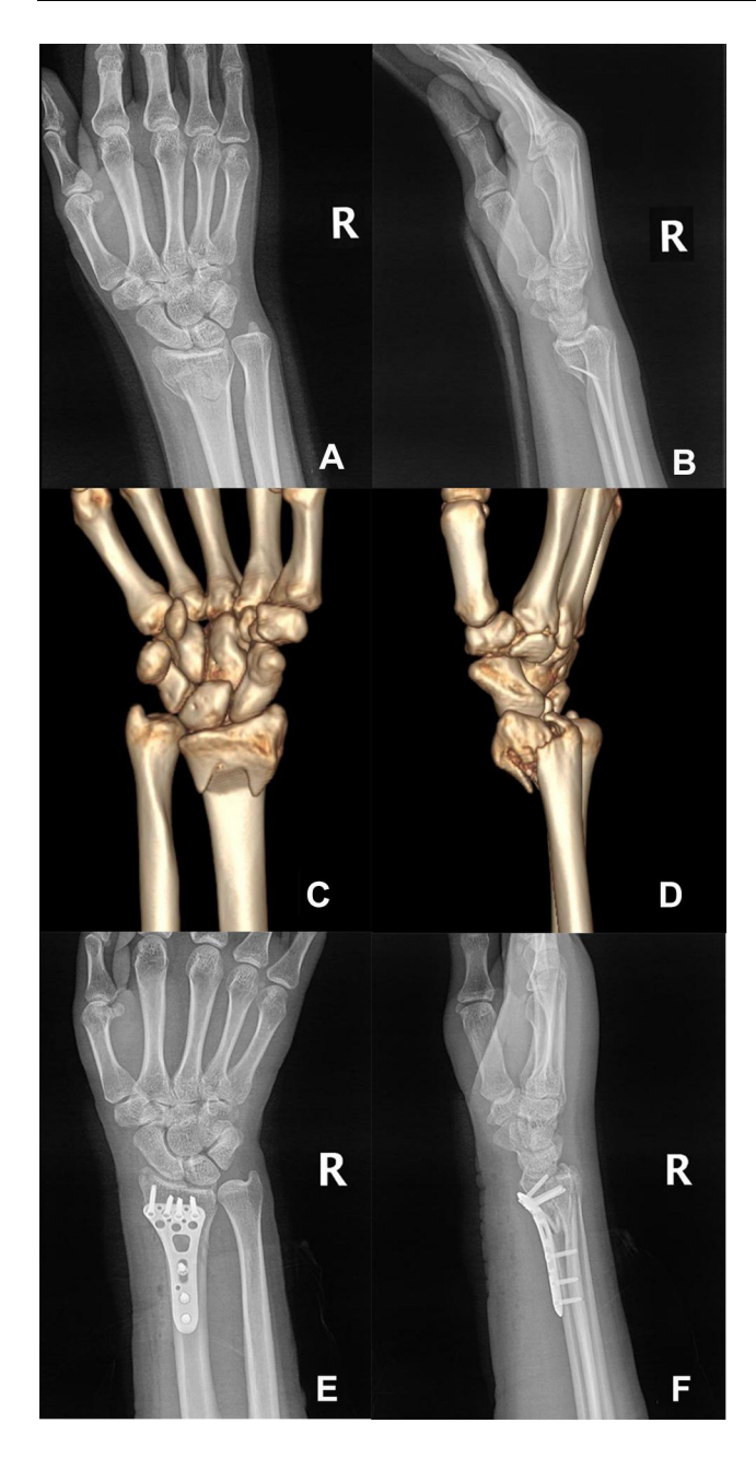
Figure 2 Preoperative X-ray films (A and B) and three-dimensional reconstructive CT images (C and D) of right wrist. Postoperative X-ray films of right wrist (E and F).

should be higher considering the missed diagnosis and the failure of patients to seek medical treatment in time. So far, the etiology, pathogenesis, diagnosis and treatment of PLO remain controversial.<sup>1</sup>