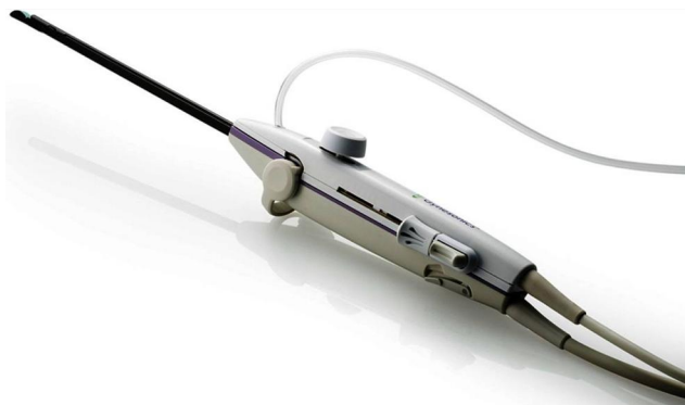
Figure 1 The Sonata transcervical fibroid ablation device. The device consists of an integrated intrauterine sonography probe with a radiofrequency ablation handpiece.

The sonography-guided TFA procedure treatment device (Sonata ® system, Gynesonics, Inc., Redwood City, CA, United States) includes an integrated intrauterine sonography probe and radiofrequency ablation handpiece that allows the gynecologist to identify, target, and ablate uterine fibroids (Figure 1). The integration of real-time ultrasound imaging enables the physician to visualize, target, and ablate a greater range of fibroids than could be approached via operative hysteroscopy. A graphical interface is displayed on the live ultrasound image that identifies the target ablation area and the extent of sub-ablative thermal heating. The gynecologist utilizes this information to confirm the ablation is within the fibroid while confining the thermal safety border to within the uterine serosa. A single ablation may suffice to treat a fibroid, but