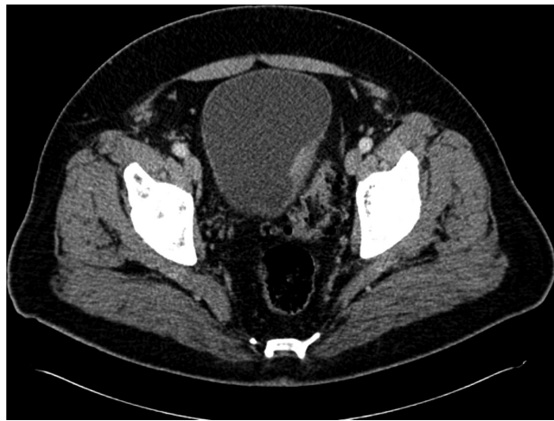
Figure 2 Demonstrates a localized mass in the posterior aspect of the bladder wall which is organ confined. There is no pelvic lymphadenopathy.

The diagnosis was therefore carcinoma in situ with an ‘incidental’ isolated extramedullary plasmacytoma of the urinary bladder.