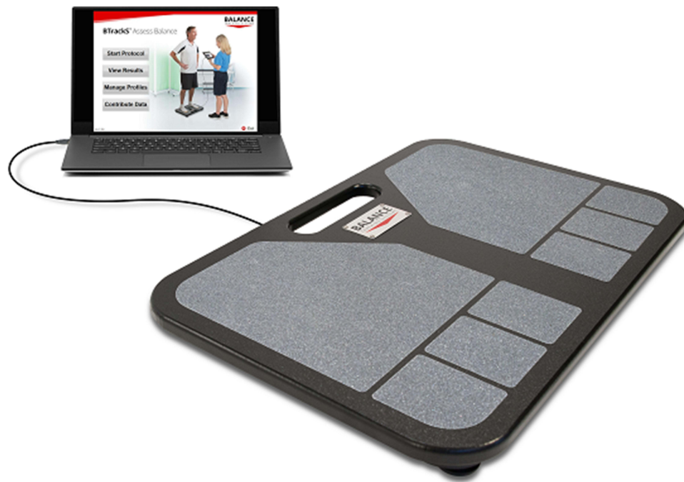
Figure 1 Experimental equipment used in this study included the BTrackS Balance Plate (right) and BTrackS Assess Balance software running on a laptop (left).

COP data have found it to be ecologically valid, highly accurate, and precise. 10–13 For some conditions in this study, participants were also asked to stand on a lightweight, high-density foam cushion provided with the BTrackS Balance Plate and software. The top surface of the foam cushion was 0.5×0.4 m and the height was 6 cm.