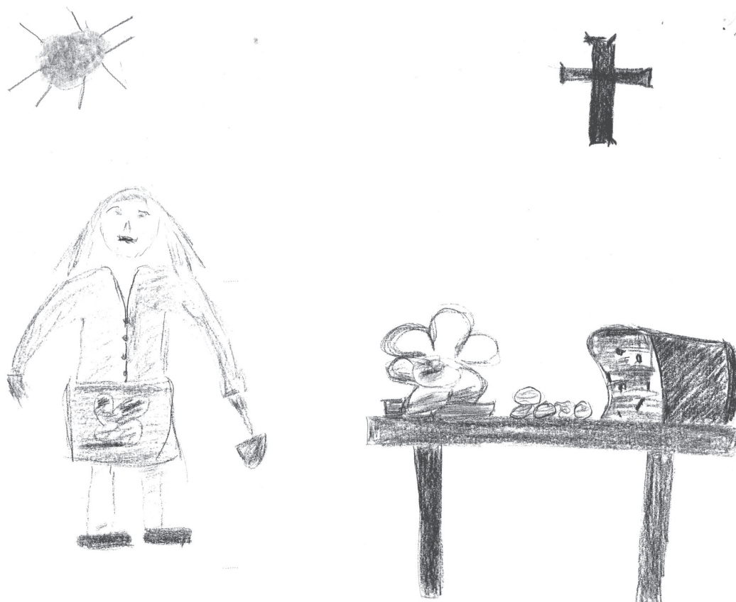
Figure 2 A drawing by a girl with celiac disease of her mother, “cozonac”, and other cakes during an Easter holiday in Romania.

powdered milk, causing re-emergence of symptomatic celiac disease. 25,26 Last, but not least, nostalgia is an emerging problem affecting sick immigrant children in Europe. This has not yet been taken into consideration, and presently seems an impossible problem to solve, with few children’s hospitals in Italy, ie, Burlo Garofolo and Gaslini, as well as public and private foundations or volunteer associations, in a position to address it.