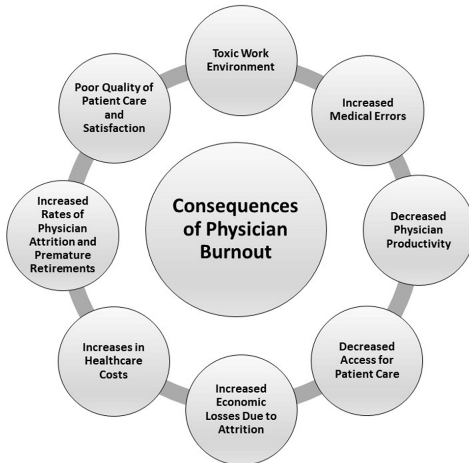
Figure 1 Consequences of physician burnout.