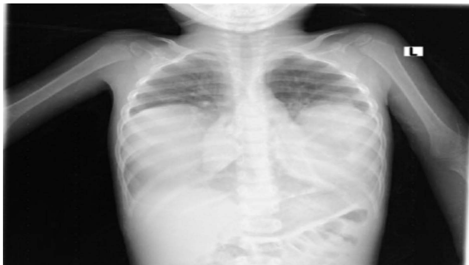
Figure 1 PA chest x-ray showed bilateral lung mass with opacification of the right and left hemithorax.

degrees centigrade. Chest examination showed flaring of alae nasi, subcostal and intercostal retractions, diffuse bilateral wheeze and decreased air entry on lower lung fields bilaterally.