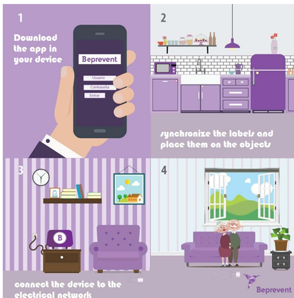
Figure 1 Beprevent Device.

Patient confidentiality will be preserved and will not be made public, in accordance with applicable laws and regulations. Specifically, all actions will comply with Regulation (EU) 2016/679 of the European Parliament and of the Council, of 27 April 2016, regarding the protection of natural persons with regard to the processing of personal and free data.