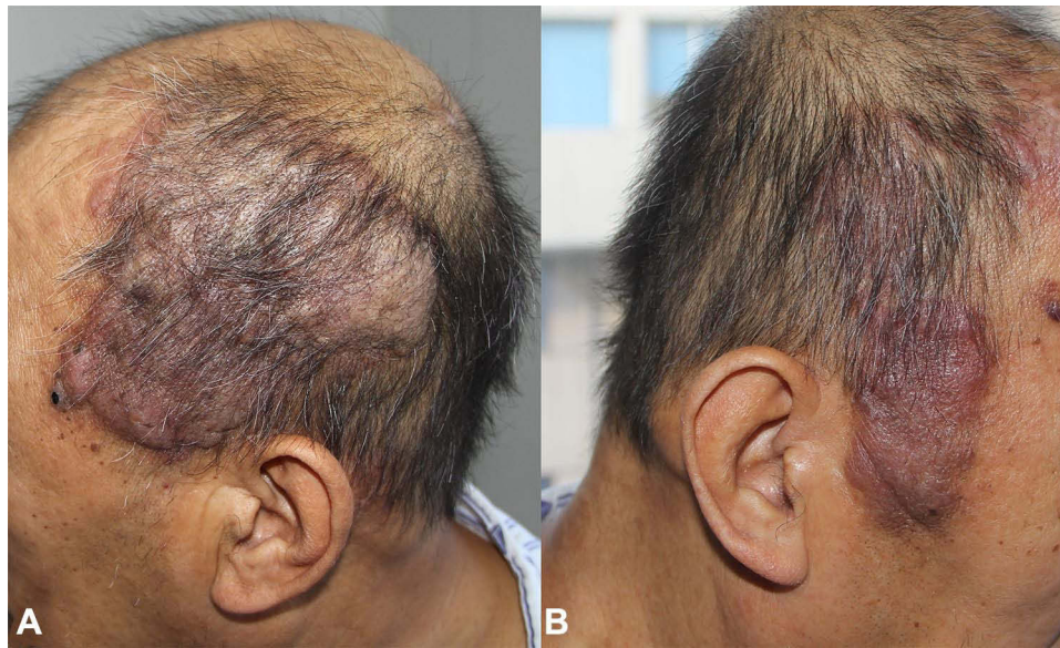
Figure 1 (A and B) Multiple irregular-shaped, dark-red, soft to fluctuant, well-demarcated, and infiltrated plaques ranging in size from 1 to 8 cm in diameter disseminating on the head.