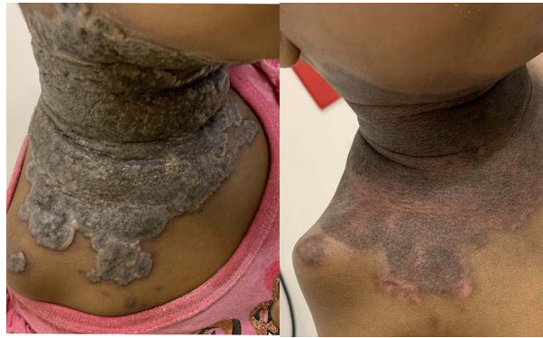
Figure 3 Before and after images of vegetative plaques with surface erosions as well as characteristic snail-track border.

Histopathology specimens taken from scalp and neck lesions demonstrated epidermal hyperplasia with areas of ulceration, suprabasal acantholysis, marked eosinophilic infiltrate admixed with neutrophils in the papillary and superficial dermis and relatively spared deeper reticular dermis. See Figure 4 . To rule out other autoimmune blistering dermatosis, a direct immunofluorescent test was done and the results were negative. With careful clinico-pathologic correlation, the above features were consistent with the diagnosis of PD-PSV. The characteristic clinical morphology of skin lesions (non-bullous, vegetative plaques with snail track border) were not consistent with the other bullous dermatosis that could very well make the diagnosis of PD-PSV prove to be difficult. Considering the negative direct immunofluorescence results, peripheral eosinophilia and careful clinico-pathologic correlation, a diagnosis of PD-PSV was made.