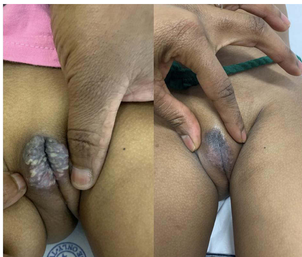
Figure 2 Genital vegetative plagues with yellowish pustules on surface before and after 8 weeks of azathioprine treatment.