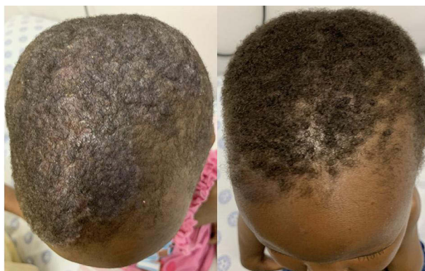
Figure 1 Lesions on scalp, before and after 8 weeks of azathioprine treatment.

A complete work-up was conducted to include an HIV test (negative), primary immunodeficiency screen (normal), complete blood count, thyroid (normal), liver and renal function tests, visceral radiology (normal), histopathology, and blood cultures (negative). Both upper and lower gastrointestinal scope (GI Scope) results were unremarkable. Except for pronounced eosinophilia of 21.5% (normal range 0–0.5%), hypoalbuminemia of 14g/L (normal range 29–42g/L), thrombocytosis of 826 \times 10^9/L (normal range 180\text{--}440 \times 10^9/L ) and lymphocytosis of 20.41 \times 10^9/L (normal range 6\text{--}18 \times 10^9/L ), no other abnormalities from the panel of all blood tests.