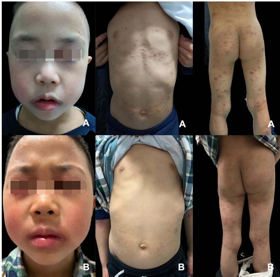
Figure 2 Erythema, papules, and lichenoid lesions of patient seven before dupilumab (A). Remarkably improved lesions on the body after treatment; however, lips are still red, swollen, and chapped (B).