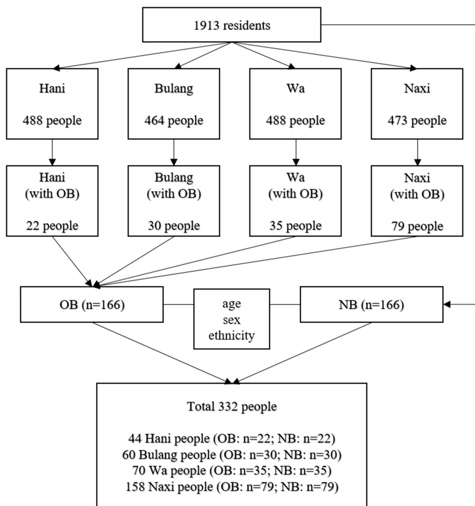
Figure 1 Inclusion process of enrolled people.

Abbreviations: OB, obesity group ( \text{BMI} \geq 28.0 \text{ kg/m}^2 ); NB, normal-BMI group ( 18.5 \leq \text{BMI} < 24.0 \text{ kg/m}^2 ).