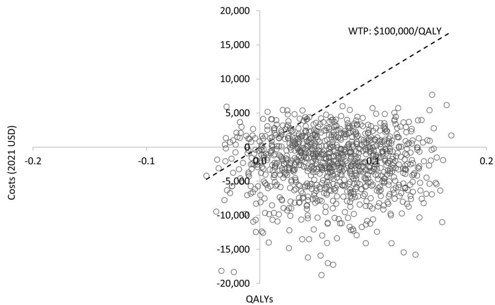
Figure 3 Scatterplot evaluating the influence of uncertainties on the ICER over 12 months from the payer perspective (probabilistic sensitivity analysis). Abbreviations: ICER, incremental cost-effectiveness ratio; QALY, quality-adjusted life-year; USD, United States Dollar; WTP, willingness-to-pay.