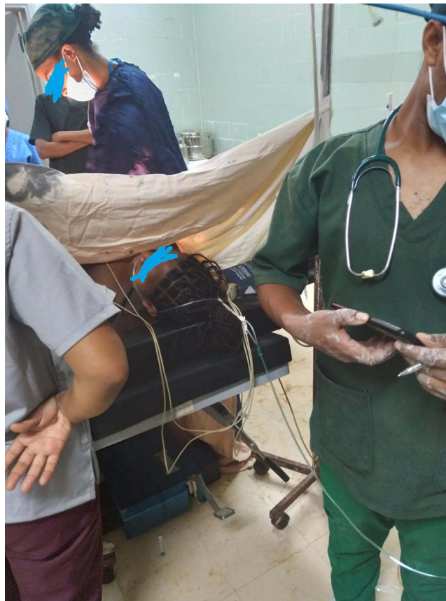
Figure 1 Summary of intraoperative supplemental oxygen given to 30 years old with chronic rheumatic heart disease and moderate pulmonary hypertension pregnant mother.

morbidity and death are significantly influenced by heart disease during pregnancy. 13 Prior to delivery, pregnant patients with pulmonary hypertension and significant multivalvular heart disease need to undergo careful preoperative, multi-disciplinary assessment, and anaesthetic planning to maximize cardiac function during the peripartum period and make informed decisions about the delivery mood and anaesthetic technique. 4