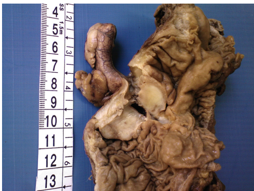
Figure 1 Fibromatosis occluding the lumen of appendix.

Fibromatosis, also known as desmoid tumors, are local aggressive benign neoplasms which originate from musculoaponeurotic structures of the body. They may have a peripheral or intra-abdominal localization. Fibromatosis may be associated with Gardner's syndrome and familial polyposis coli. 3 Colonoscopy can show the colonic polyps whereas fundoscopy can display multiple pigmented lesions in the retina. While intra-abdominal fibromatosis generally originates from the mesentery of the small intestine, there are also involvements reported in the retroperitoneum, transverse mesocolon, and omentum. 4 Rarely, it can also stem from the intestinal wall like submucosal benign lesions such as inflammatory fibroid polyp, leiomyoma, etc, and gastrointestinal stromal tumor (GIST), and mimic a gastrointestinal malign neoplasia. Pathology bears importance in differential