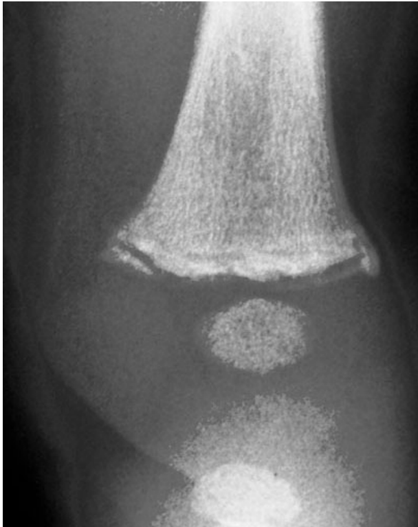
Figure 2 Metaphyseal fracture of the lower left femur in a 2-month-old girl thought to have temporary brittle bone disease. In this child, the metaphyseal abnormalities were symmetrically distributed.

After return home, three patients had further fractures at ages two, six, and seven years. In each case, there was general agreement at the time that these fractures had innocent explanations. One girl sustained a fractured radius and ulna at age two years when jumping into a chair at a mothers' and toddlers' group with many witnesses. One boy had a fractured radius and ulna while playing at a neighbor's house at the age of six years. One very energetic boy sustained a fractured metatarsal at the age of six years and a fractured metacarpal