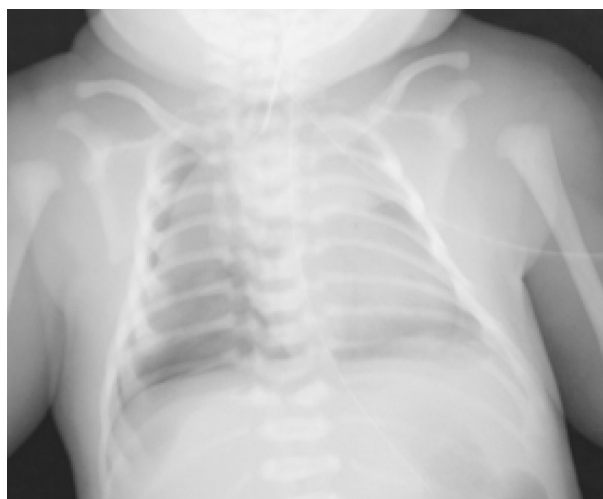
Figure 3 Chest X-ray from Case 2 on admission.

At 9 hours old, progressive hypoxia developed with a postductal arterial oxygen saturation of 88%, despite FiO 2 of 1.0. Echocardiography revealed supersystemic pulmonary artery pressures and tricuspid regurgitation, so NO therapy