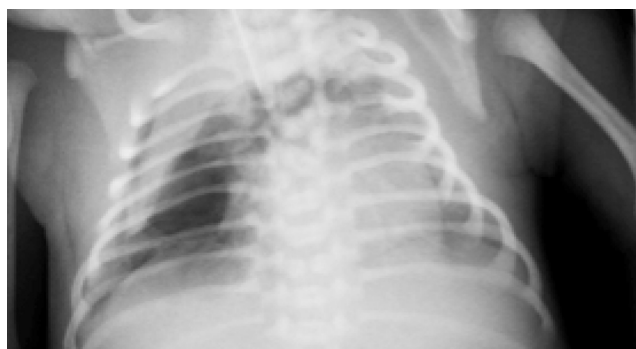
Figure 1 Chest X-ray from Case 1 on admission.

0.07 mL/cm H 2 O/kg before ECMO, as measured using a pneumotachograph (ARFEL-VR®; Aivision, Tokyo, Japan) with the passive expiratory flow technique. After starting ECMO, oxygenation index started improving. After 70 hours on ECMO, the infant was successfully weaned from ECMO with a postductal PaO 2 of 123 mmHg, and a PaCO 2 of 33.6 mmHg. Static lung compliance was 0.36 mL/cm H 2 O/kg at that time. NO therapy was temporarily reinstated, but discontinued after 2 days. From 9 days old, the patient was ventilated with intermittent mandatory ventilation. Progressive weaning from ventilator support was initiated, with the infant successfully extubated at 11 days old. Static respiratory compliance was 0.62 mL/cm H 2 O/kg at that time.