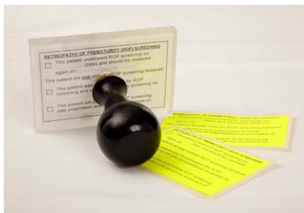
Figure 2 The retinopathy of prematurity sticker incorporated into a stamp and placed on a bright yellow sticker.

Of those not seen, the distribution of reasons for failure to undergo review is shown in Table 2.