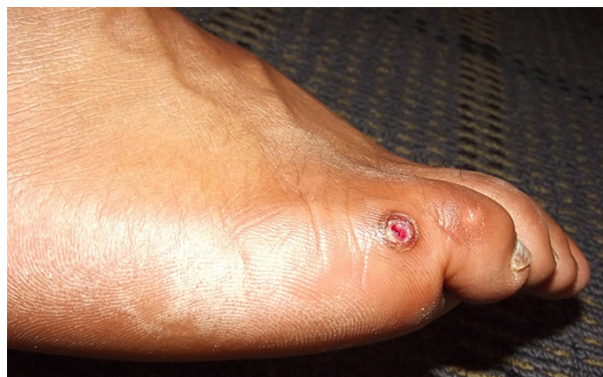
Figure 2 Circular ulcerous furuncular lesion of the lateral dorsum of the right foot, adjacent to the base of the fifth toe, 24 hours following the removal of a prepupal larva of the tumbu fly, Cordylobia anthropophaga .

The African tumbu fly (also known as the mango fly and putzi fly) is responsible for the majority of furuncular lesions in Sub-Saharan, Central, and West Africa. 1-3,6,11-13 Infestation in humans by larvae of the tumbu fly was first described in a patient from Senegal in 1862. 1 Female tumbu flies normally oviposit between 100–300 eggs, usually in an aggregate mass, in sandy soil or sod contaminated with animal feces, urine, or garbage. 1,14 The hatched larvae can remain viable in the soil for 9–15 days, until at which time they need to find a host for further development. 15 The tumbu fly may deposit eggs on clothing that has been spread on the ground to dry, on improperly washed diapers placed in the shade to