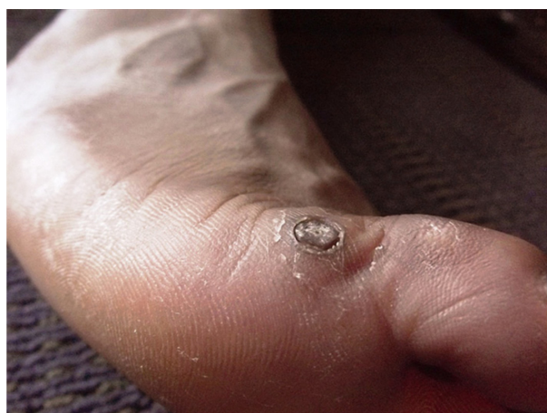
Figure 1 Circular ulcerous furuncular lesion of the lateral dorsum of the right foot, adjacent to the base of the fifth toe, containing a compressed prepupal larva of the tumbu fly, Cordylobia anthropophaga .

During the summer of 2012, a 26-year-old male medical student visited Ntagatcha, Tanzania for a medical mission trip. Three weeks following his return to the United States, he noticed a scab developing on the side of the fifth digit on his right foot (Figure 1). He dismissed the scab as a simple corn or callus, which he thought was a result of his close fitting shoes and soccer cleats. One month later, he noticed that the scab became raised and sore with activity. One week later he noticed the scab looked greenish and decided to remove its top layer. Instead, an entire plug of