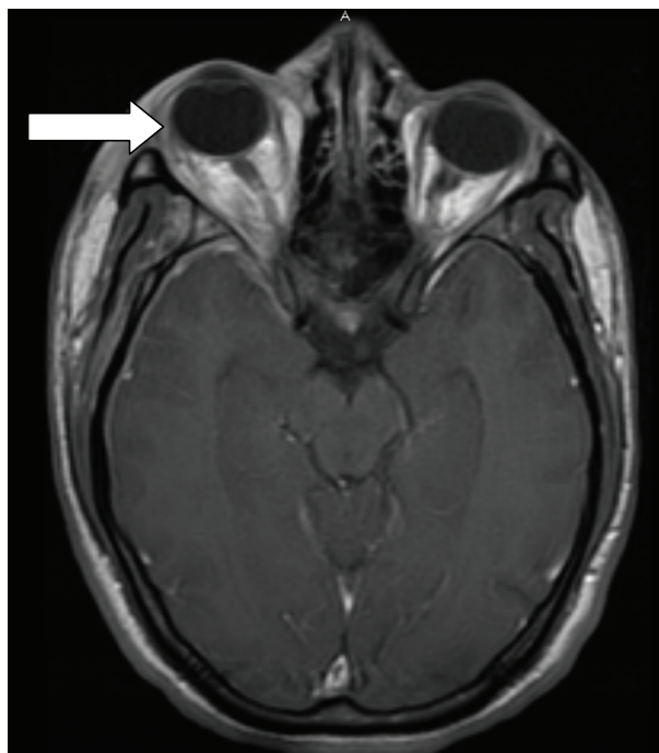
Figure 2 Right eye proptosis (arrow).

GCS is a rare cause of bacteremia, mostly associated with zoonological infections. 1-8 It can cause a mucopurulent pulmonary disease in horses and mastitis in cattle. 2,3 In humans, GCS can be part of the normal oral, skin, and genitourinary flora but, GCS infection can be highly virulent, causing rapid, disseminating disease 2-4 carrying with it a mortality of