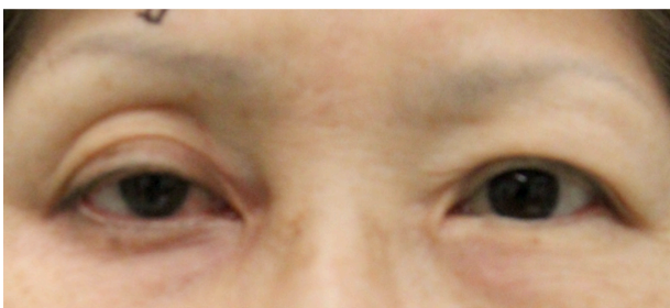
Figure 1 Preoperative clinical photo of patient's eyelids.

The pre- and postoperative clinical photos of her eyelids are shown in Figures 1 and 2, respectively. Preoperatively, she had clinically significant right ptosis obscuring her visual axis, and right lagophthalmos with orbicularis oculi muscle weakness.