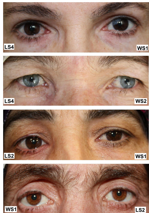
Figure 2 Appearance of patients graded according to the evaluation performed by the first ophthalmologist.

Abbreviations: LS, linear skin; WS, W-shaped.