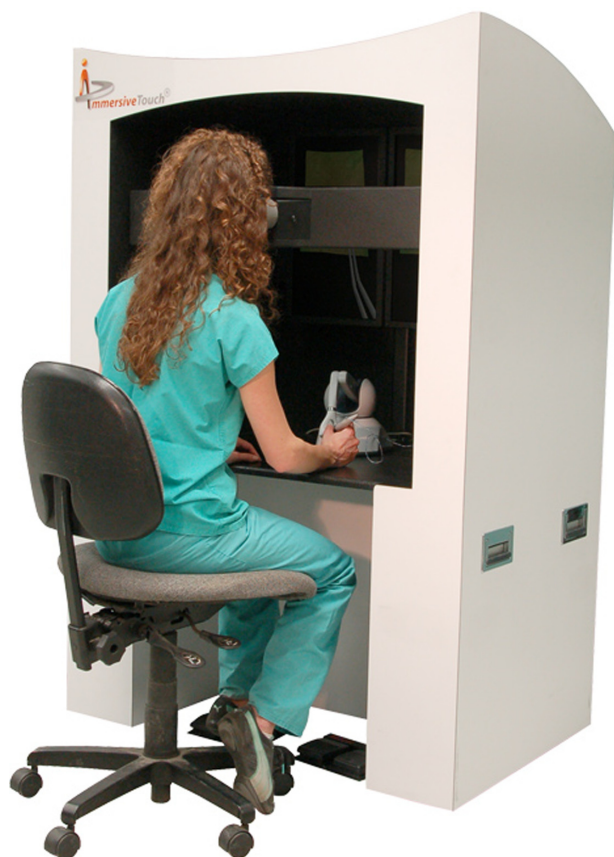
Figure 1 An image of an operator using virtual reality system MicroVisTouch (ImmersiveTouch, Chicago, IL, USA) using haptic (tactile) feedback and stereo viewer for vitreoretinal surgery simulation.

While cataract surgery is routinely trained on simulators, retinal surgical simulation is in general less common. Vitreoretinal surgery is a complex surgery requiring a high level of dexterity and coordination, and the learning