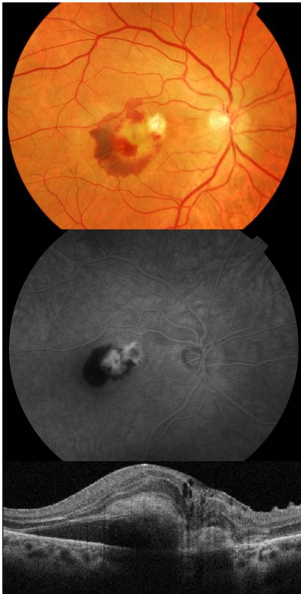
Figure 2 Recurrence of the choroidal neovascularization activity with a central macular thickness of 349 \mu\text{m} .

close to the center of the fovea is one of the main ones and was present in our patient. Most patients do not achieve a final visual acuity better than 20/40 in this situation. Moreover, direct choroidal ruptures secondary to IOFB trauma may lead to more aggressive CNV than indirect ruptures, probably due to greater activation of proangiogenic and inflammatory mediators with a direct impact on the retina and causing extensive damage to the subretinal tissues.