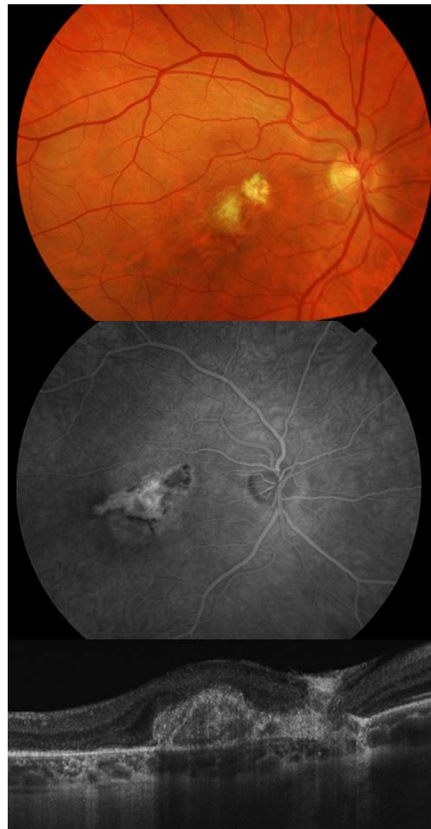
Figure 3 Spectral-domain optical coherence tomography confirmed reduction of the choroidal neovascularization activity with a central macular thickness of 275 \mu\text{m} and disappearance of the retinal hemorrhage. Leakage from the choroidal neovascularization in the fluorescein angiography had ceased.

On the other hand, considering that this was a vitrectomized eye, the half-life of intravitreal anti-VEGF was probably shorter than normal, so requiring more frequent injections.