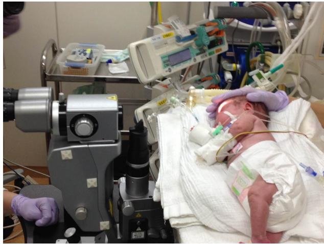
Figure 3 Removal of the chinrest to fix the patient with an incubator tube in a lateral decubitus position.

deliver the laser photocoagulation via a table-mounted slit lamp (Figure 3). Furthermore, the laser photocoagulation procedure time amounted to about 40 minutes, which was almost the same as with a conventional laser. However, this was our first case where we treated ROP by PASCAL, and it took extra time to set up and position the system during laser photocoagulation. Thus, we estimate that the procedure time can be reduced by up to 50% when compared to conventional laser once we encounter more ROP cases.