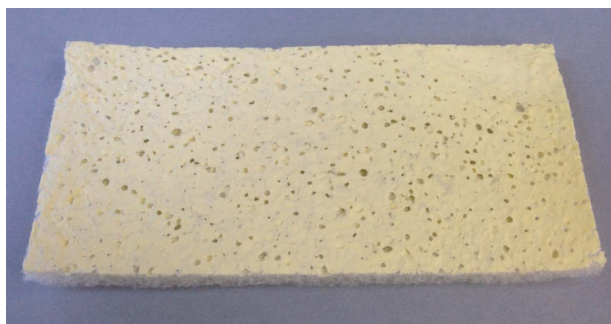
Figure 1 TachoSil fibrin sealant patch with active yellow side facing upwards.

Its safety profile is related to the use of pooled human plasma-derived fibrinogen and thrombin as well as equine collagen. 7,20 The pooled plasma may be associated with blood-borne disease transmission of viruses and prions. 20 Thus, there is a potential risk of HIV, hepatitis A, parvovirus B19, and Creutzfeldt–Jakob disease (CJD) transmission. 7 Efforts to minimize these risks include donor screening for a high-risk history, serologic and polymerase chain reaction testing, and antiviral processing such as pasteurization, precipitation, adsorption, pH, and gamma irradiation. 7 There is also a risk of allergic reaction and anaphylaxis in patients sensitive to human or horse proteins, as well as the risk of thromboembolism. 7 The patch should not be used intravascularly, in the renal pelvis or near the ureter, in between the edges of the skin, in neurosurgery, in closed or infected spaces, or in treating severe or brisk arterial bleeding. 7 In addition, overpacking of patches should be avoided. 7 Migration of the patch inside the body is possible. 7 Exposure of the patch to alcohol, iodine, or heavy metals can inactivate the patch. 7 There are limitations on the number of patches that should be used in a patient depending on